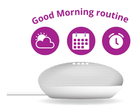
Google Assistant can help organise your day