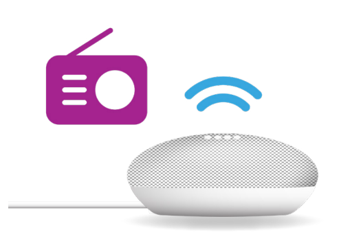
You can search for and play internet radio on a smart speaker

While smart speakers and other smart home devices do not need very much data, most will stop working if you run out of data allowance. An unlimited home data plan helps ensures your smart home won't miss a beat.