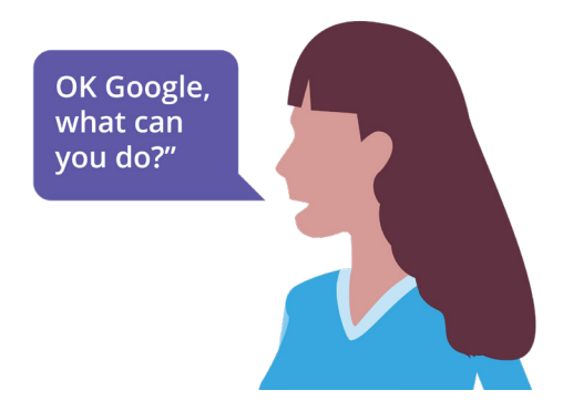
Experiment with a smart speaker to discover what it can do