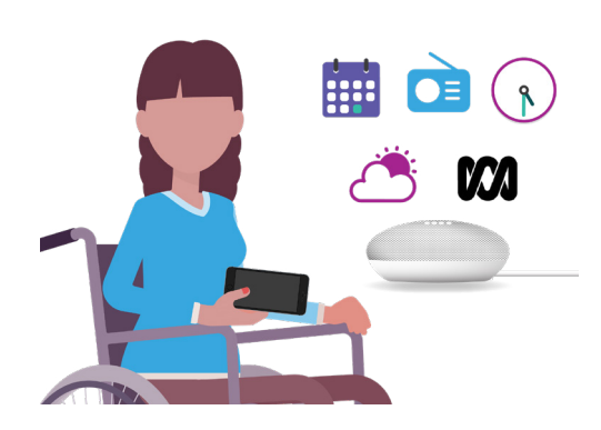
Smart speakers can help you stay organised, and provide information and entertainment